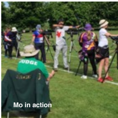
Mo in action

During the weekend of May 14th/15th , Bowmen of Glen welcomed some of the countries top archers for two days of competition. The weather was great for shooting, maybe a bit too hot for comfort at times.