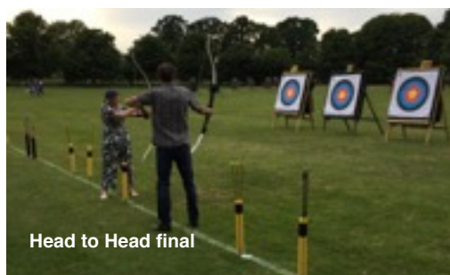
Head to Head final