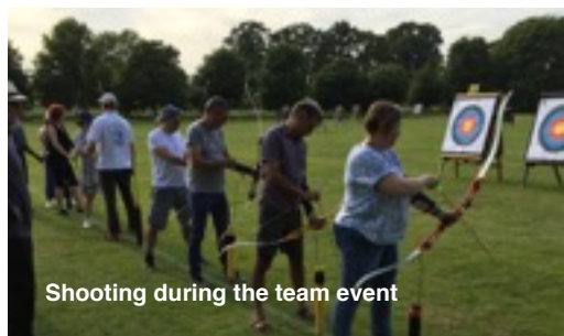
Shooting during the team event