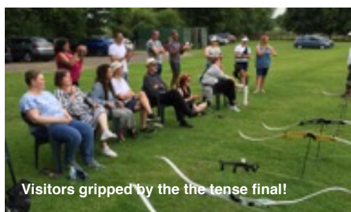
Visitors gripped by the the tense final!