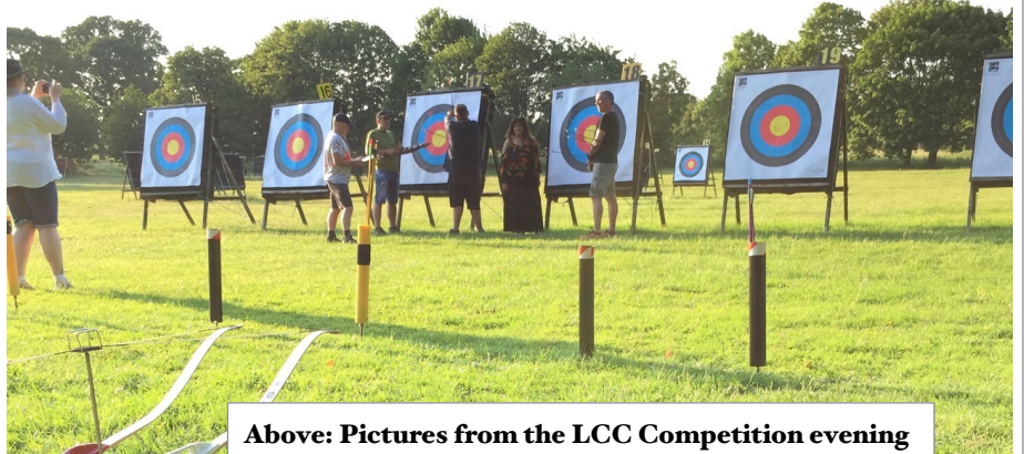
Above: Pictures from the LCC Competition evening