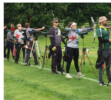
Good to see BOGAS shirts on the shooting line.