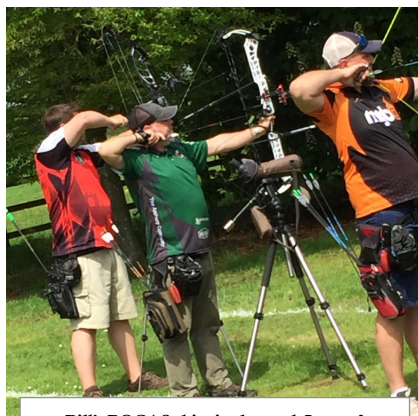
Bill's BOGAS shirt in the wash I guess?