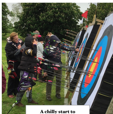
A chilly start to Saturday's shooting